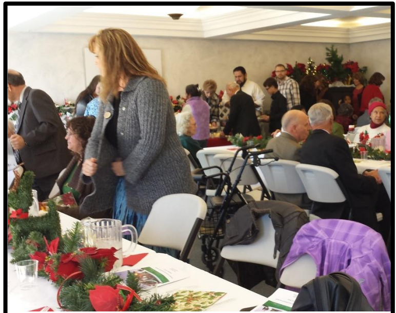
Special Potluck after Installation Service