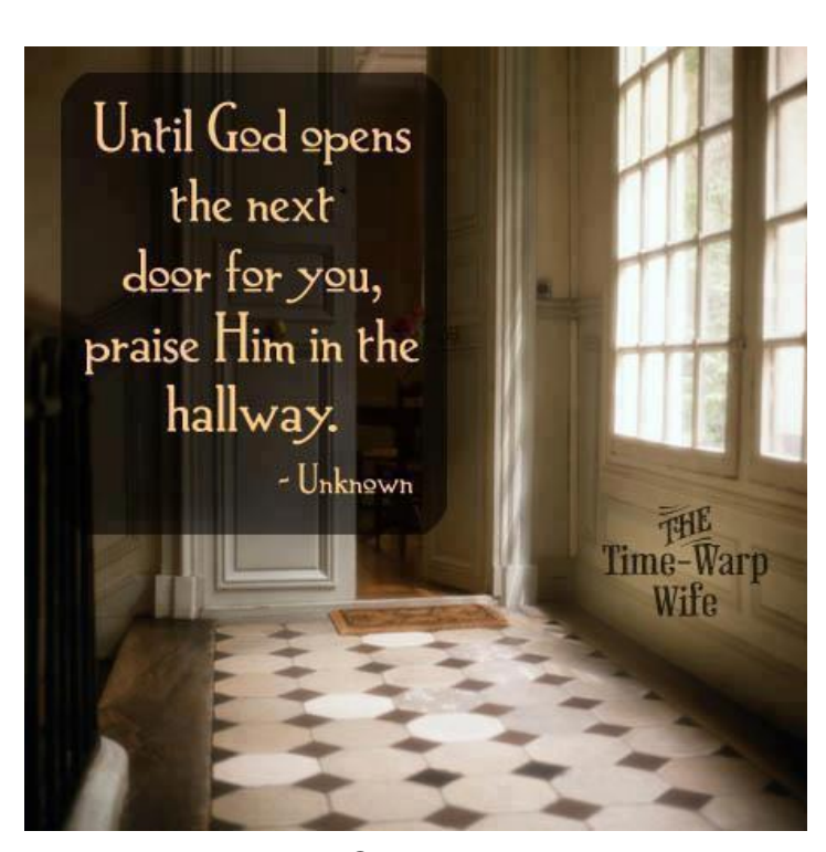
2nd Quarter 2013