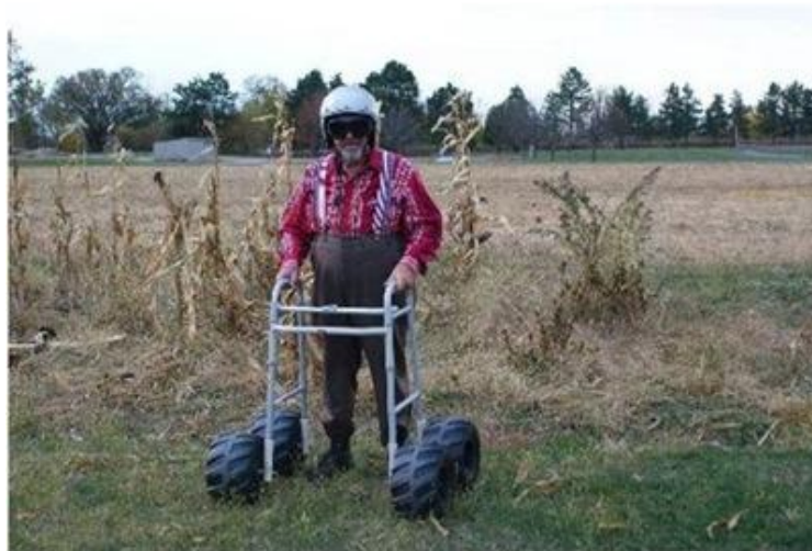
GETTING OLD IS EASY - HAVING FUN AT IT IS THE REAL TRICK

LIFE IS FLEETING BY. ENJOY IT WHILE YOU CAN