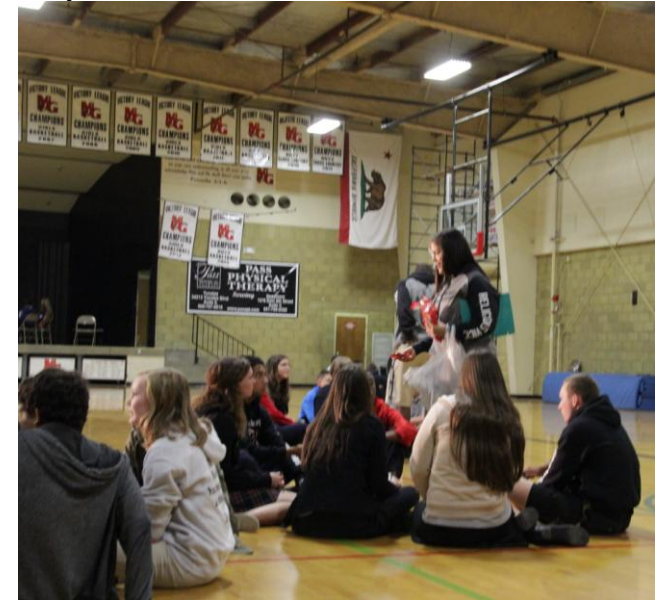
The upcoming fall fair is an opportunity for you to bond with Mesa Grande Academy. Please come on Sunday, Oct. 27, from 10-3 and unite with us in festivities and food.

Spiritual bonding is one of the main reasons for Mesa Grande to exist. Weeks of Prayer take place at every grade level. This year's junior/senior high fall week of prayer included family groups that discussed spiritual issues in conjunction with giving students a sense of being part of a religious family.