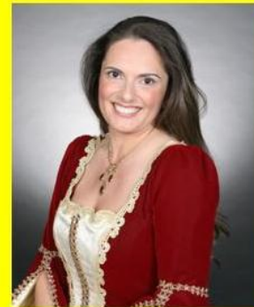
Camelia Voin, Soprano