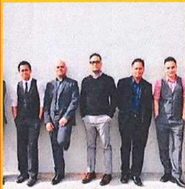
BINHI-"SEED" Filipino Vocal Group