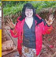
Share Your Talent