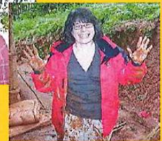
Share Your Talent