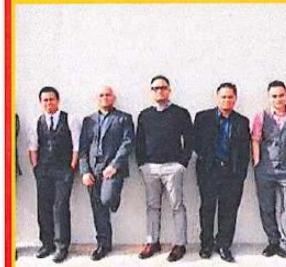
BINHI-“SEED” Filipino Vocal Group