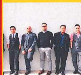
BINHI-“SEED” Filipino Vocal Group