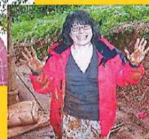
Share Your Talent