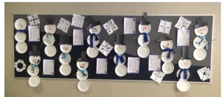
Fun snowman art by Kindergarten and 5 th grade buddies!