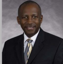
Friday, June 26, 6:30-8pm "HOW DO RELATIONSHIPS AFFECT MY HEALTH?"