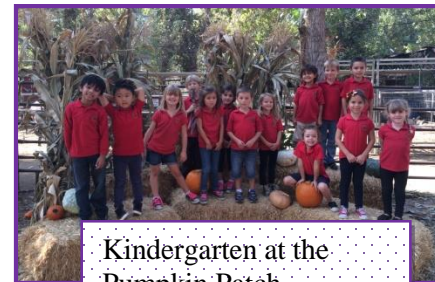
Kindergarten at the Pumpkin Patch

Feeling the Holy Spirit at work through all these activities brings joy to our hearts during the fall. Keep us in your prayers.