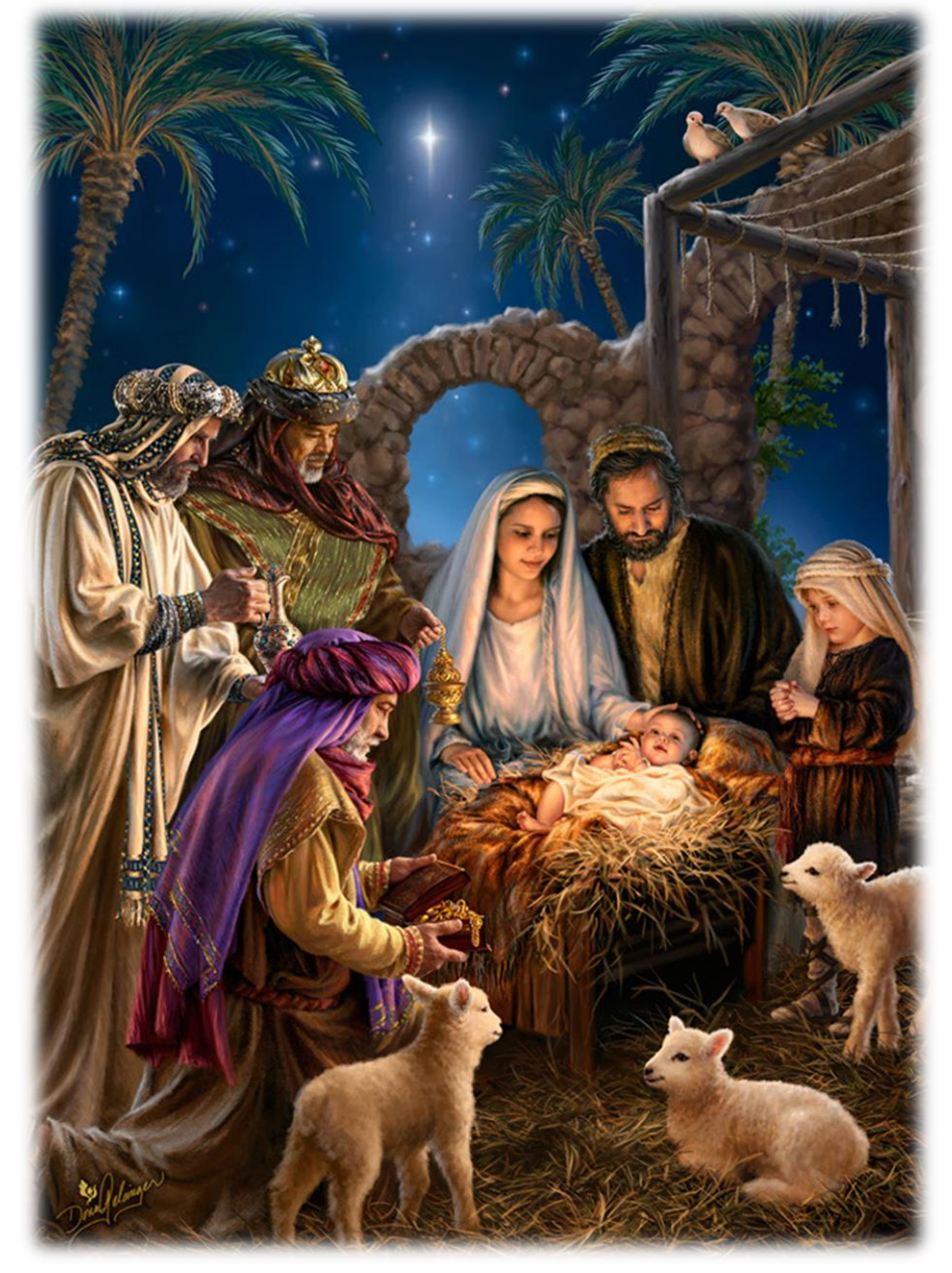
Artwork © Dona Gelsinger

Earliteens: (Family Ministries Room) Grades 7 - 8 Youth: Revive (South Patio) Youth Center, Grades 9 - 12